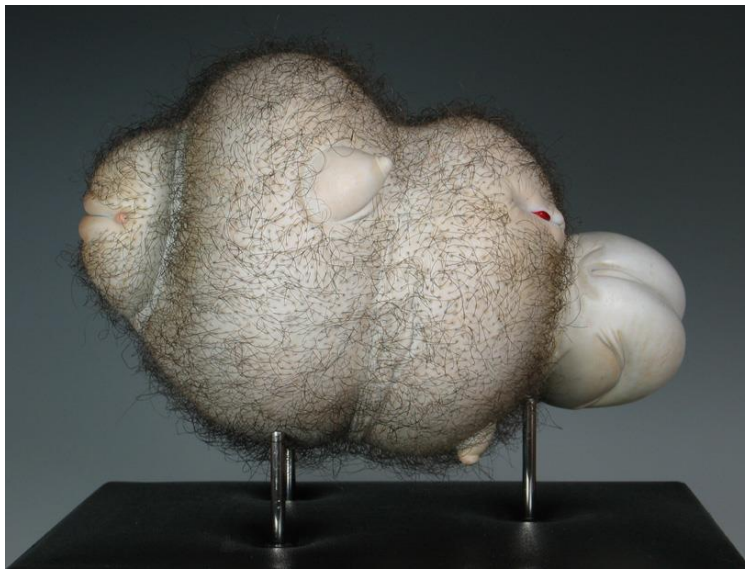
Figure 6: Jason briggs' grotesque porcelain objects are surrealistically erotic

"Monstrous Chinese objects by Jamson Brigues are surrealistic and dependent on carnal love. The art of Jamson Brigues is an expression of the powerful sexual levels with fetish points. Despite their abstract nature, they are associated with implicit life-related forms as well as weird pornographic sense of surrealism. ( https://www.designboom.com/art/jason-briggs-grotesque-porcelain-objects-07-08-2016/ )