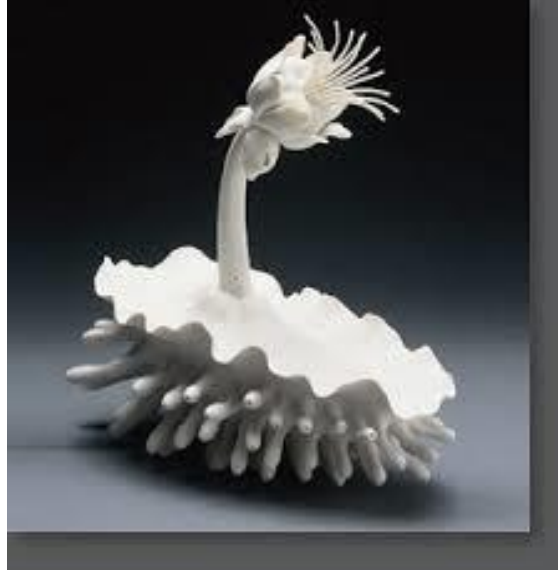
Figure 1: Lindsay Feuer Ceramic Gallery

http://www.lindsayfeuer.com/cgi-bin/gallery.pl