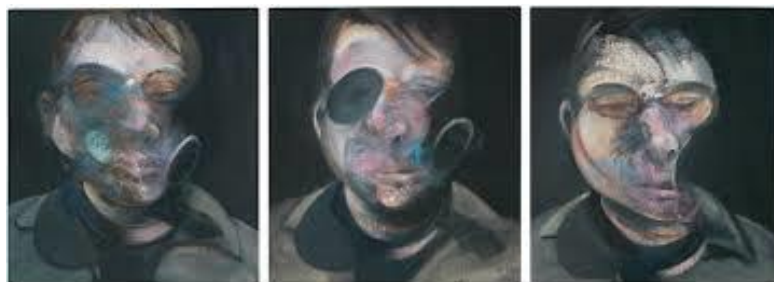
Figure 5: Three Studies for Selfportrait (1976) painted by Francis Bacon