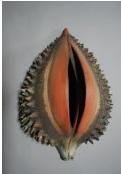
Figure 3: Elizabeth Shirirer Ceramics

https://alice-ballard.squarespace.com/pods/