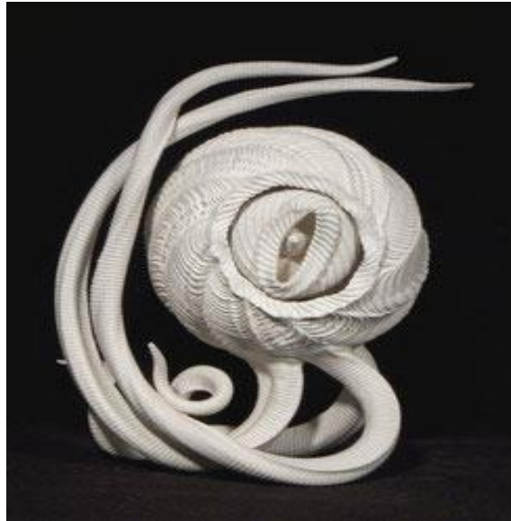
Figure 2: Surrealism and Visionary art: Charles Birnbaum

“Those statues that lie in a domain between reality and fantasia reflect the organic process of development, reproduction, and movement.”