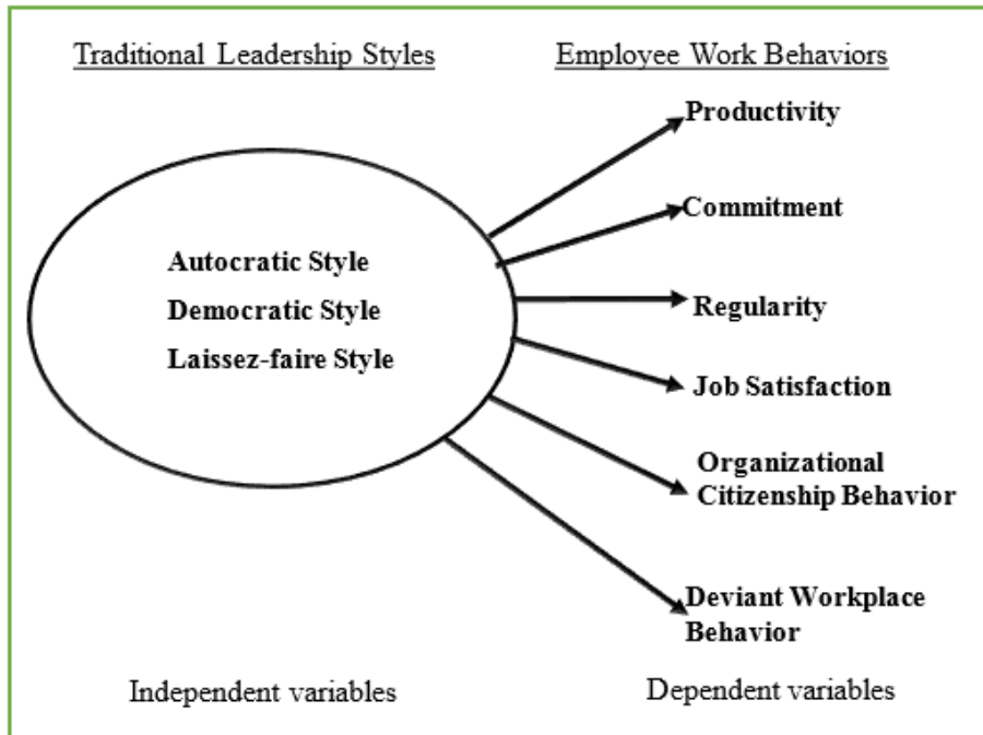
Figure 1. Conceptual Model for Traditional Leadership Styles and Employee Work Behaviors

The conceptual model in Figure 1 is showing the traditional leadership styles that were described by Iowa Studies namely; Autocratic leadership style, democratic leadership style, and laissez-faire leadership style as independent variables. Whereas, employee work behaviors that were described by Robbins and Judge (2009) and focused by various researchers in their studies to know the effects of leadership and other factors, as dependent variables.