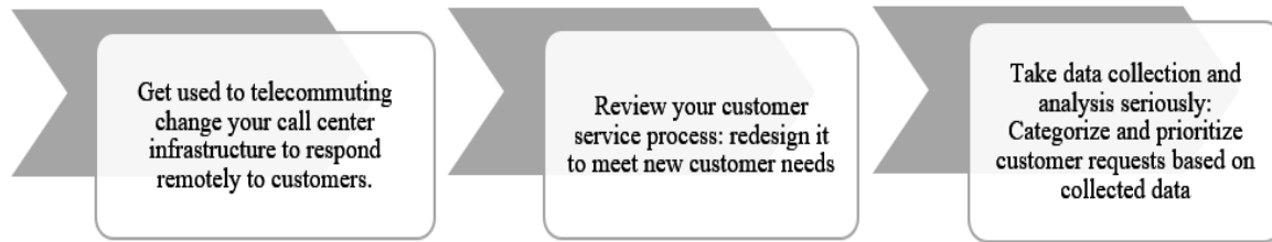
Figure 1. Key steps to provide customer service during COVID 19

Other developments in this area include the increased use of chatbots (online chatbots) to support and respond to requests.